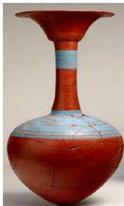
Fig. 33: Bottle from 18 th Dynasty. [37]