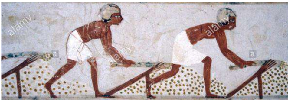
Fig. 19: Sowing scene from 18 th Dynasty. [23]