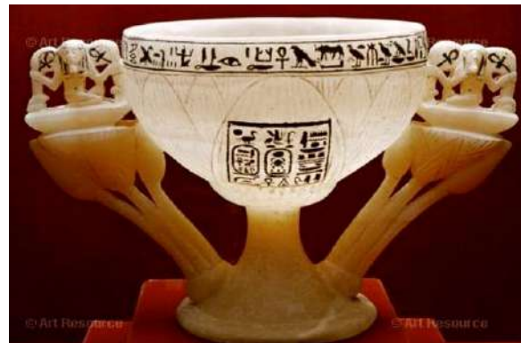
Fig. 32: Drinking cup from 18 th Dynasty. [36]