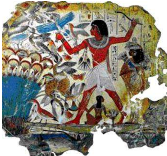
Fig. 29: Glass bottle from 18 th Dynasty. [33] Fig. 30: Hunting scene from 18 th Dynasty. [34]