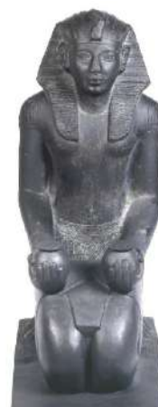
Fig. 47: Finger ring from 20 th Dynasty. [53] Fig. 48: Greywacke statue from 20 th Dynasty. [54]