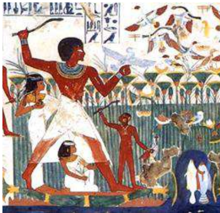
Fig. 17: Hunting scene from 18 th Dynasty. [21]