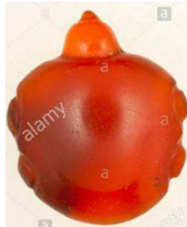
Fig. 1: Sarcophagus of a Queen from 18 th Dynasty. [3] Fig. 2: Carnelian amulet from 18 th Dynasty. [4]