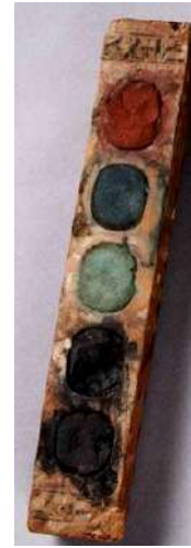
Fig. 9: Glass vessel from 18 th Dynasty. [13] Fig.10: Paint palette from 18 th Dynasty. [14]