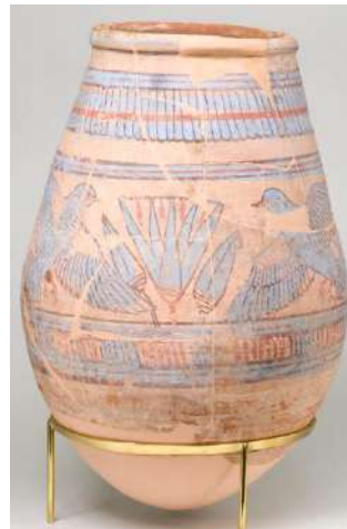
Fig. 20: Libation bottle from 18 th Dynasty. [24] Fig. 21: Pottery jar from 18 th Dynasty. [25]