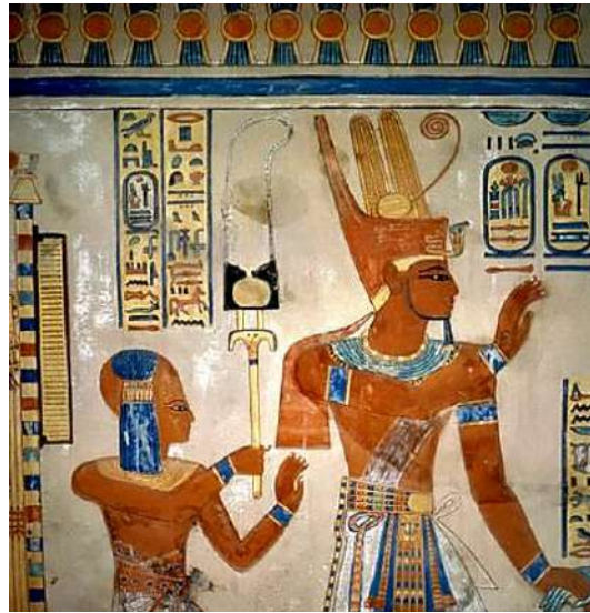
Fig. 43: Shabty of Harkhebit from 19 th /20 th Dynasties. [49] Fig. 44: Tomb wall scene from 20 th Dynasty. [50]