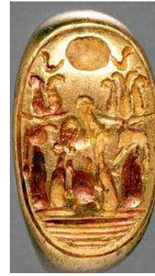
Fig. 51: Scene for Ramses IX from 20 th Dynasty. [57] Fig. 50: Signet ring of Ramses X from 20 th Dynasty. [58]