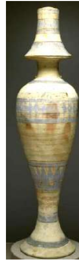
Fig. 27: Glass cup from 18 th Dynasty. [31] Fig.28: Wine jar from 18 th Dynasty. [32]