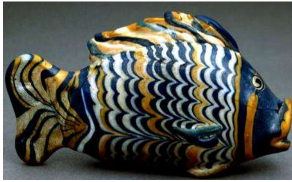
Fig. 3: Faience plate from the 18 th Dynasty. [5] Fig. 4: Fish-shaped vessel from the 18 th Dynasty. [6]