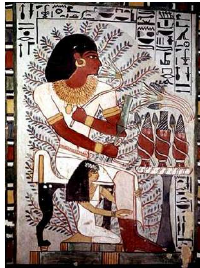
Fig. 13: Pottery jar from 18 th Dynasty. [17] Fig. 14: Sennefer scene from 18 th Dynasty. [18]