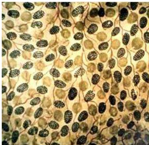
Fig. 11: Faience vase from 18 th Dynasty. [15] Fig.12: Grapes scene from 18 th Dynasty. [16]