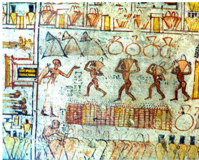
Fig. 39: Scene in Nefertari tomb from 19 th Dynasty. [44] Fig. 40: Wine production scene from 19 th Dynasty. [45]