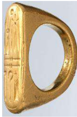
Fig. 49: Royal shabty from 20 th Dynasty. [55] Fig. 50: Signet ring from 20 th Dynasty. [56]