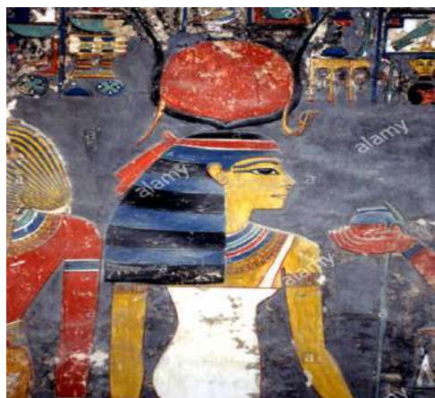
Fig. 34: Tomb scene from 18 th Dynasty. [38]