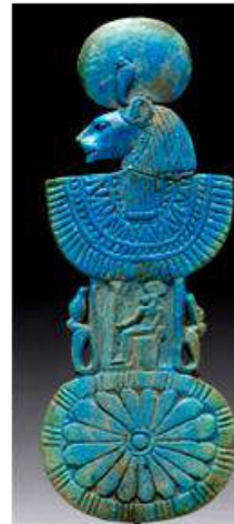
Fig.35: Pottery jar from 19 th Dynasty [40] . Fig.36: Faience necklace counterpoise from 19 th Dynasty [41] .