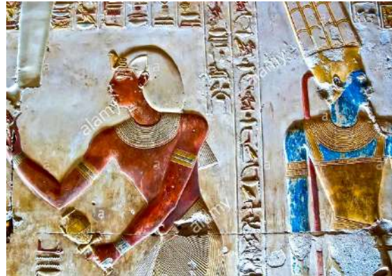
Fig. 37: Harvesting scene from 19 th Dynasty. [42] Fig. 38: Temple relief from 19 th Dynasty. [43]