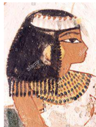
Fig. 18: Girl image from 18 th Dynasty. [22]