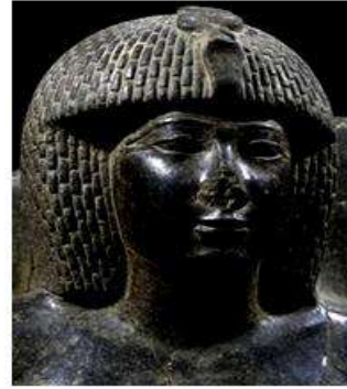
Fig.16: Statue of Thutmose IV from 18 th Dynasty [20] .