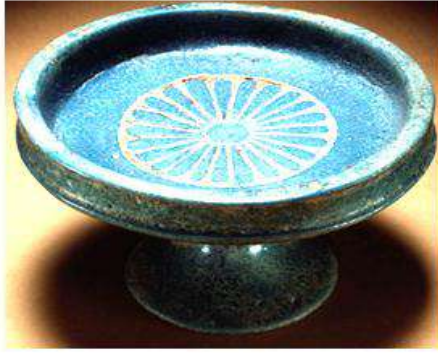
Fig.15: Faience saucer from 18 th Dynasty [19]