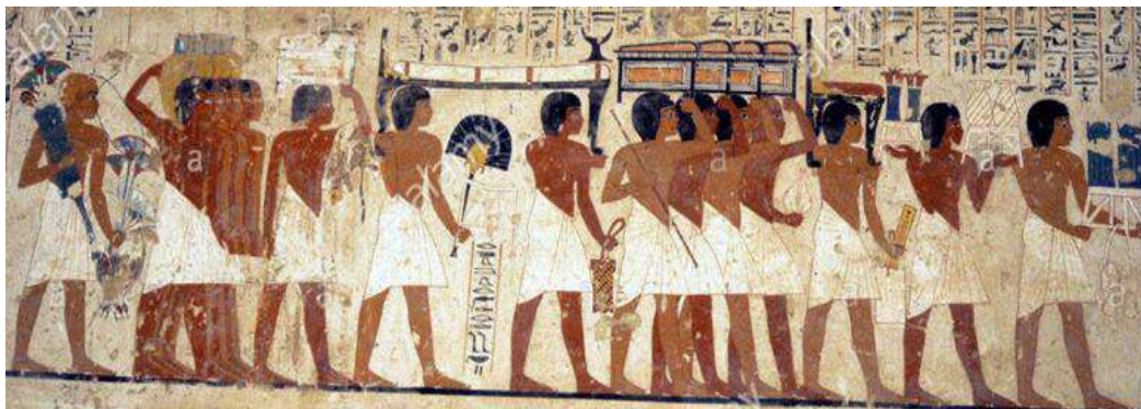
Fig. 24: Painting in the tomb of Amenhotep III from 18 th Dynasty. [28]