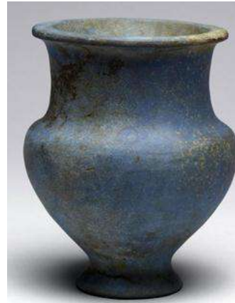
Fig. 25: Royal vase from 18 th Dynasty. [29] Fig. 26: amphora from 18 th Dynasty. [30]