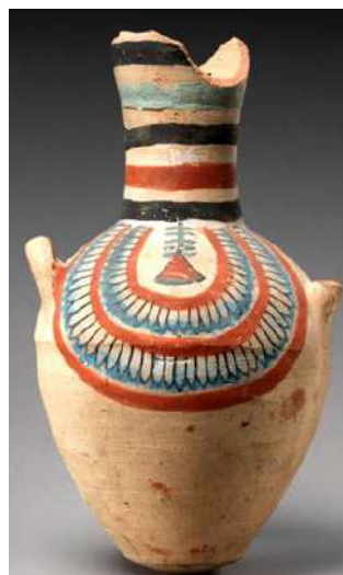
Fig. 42: Pottery jar from 19 th Dynasty. [47]