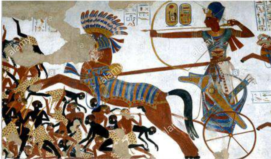
Fig. 41: Temple scene from 19 th Dynasty. [46]