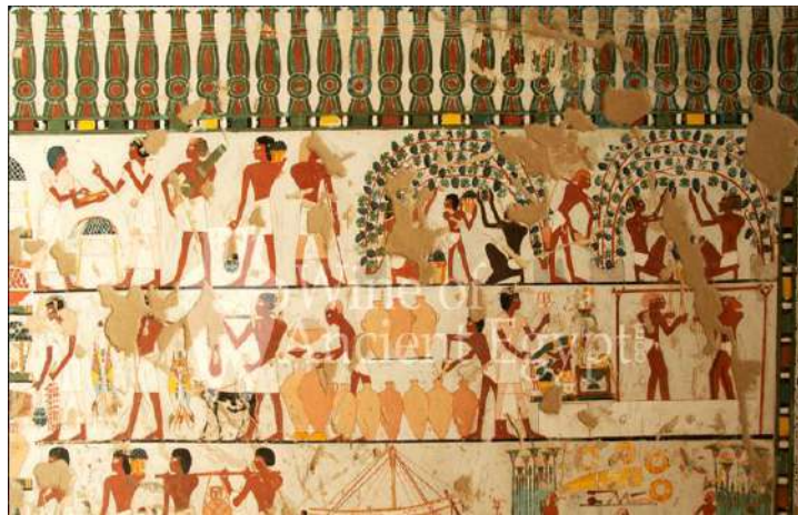
Fig. 7: Pottery jar of Kha from 18 th Dynasty. [11] Fig. 8: Scene from Khaemouaset tomb from 18 th Dynasty. [12]