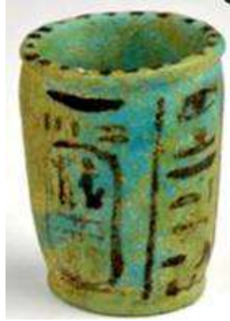
Fig. 45: Wall relief from 20 th Dynasty. [51] Fig. 46: Faience cup from 20 th Dynasty. [52]