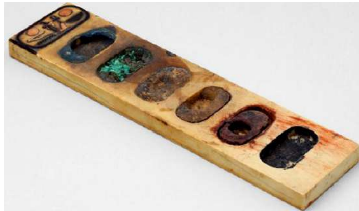
Fig. 22: Lady shabty from 18 th Dynasty. [26] Fig. 23: Palette from 18 th Dynasty. [27]