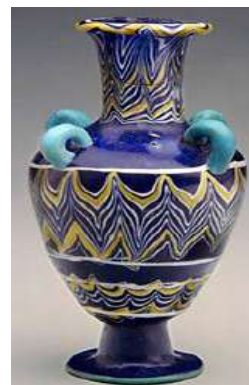
Fig. 5: Queen Ahmose-Nefertari from 18 th Dynasty. [7] Fig.6: Glass bottle from 18 th Dynasty. [9]