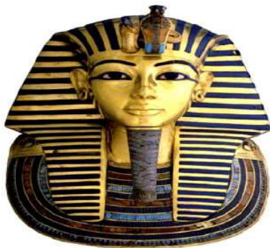
Fig. 31: Mask from 18 th Dynasty. [35]