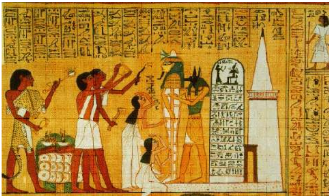
Fig. 3. Anubis is embalming one of Egyptian pharaohs.