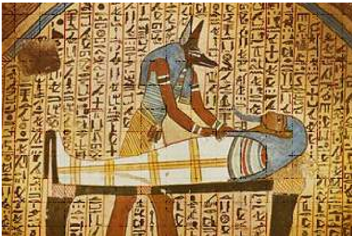
Fig. 4. The mummification ceremony of one of the pharaohs by Anubis.