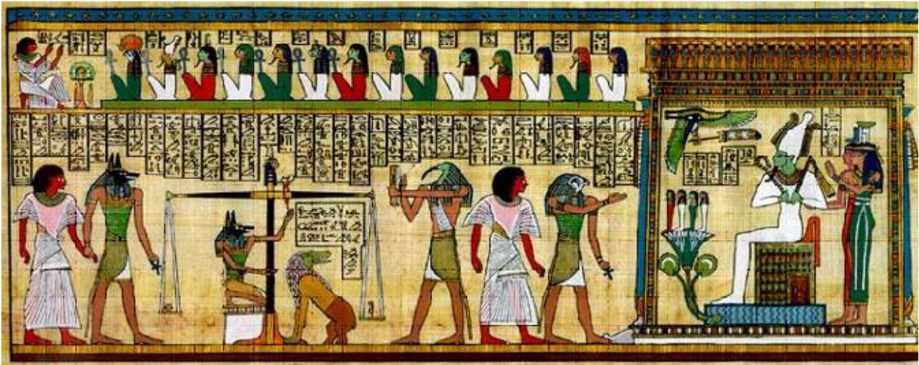
Fig. 2. The Image of the Day of Judgment.

The picture below shows the afterlife and the Day