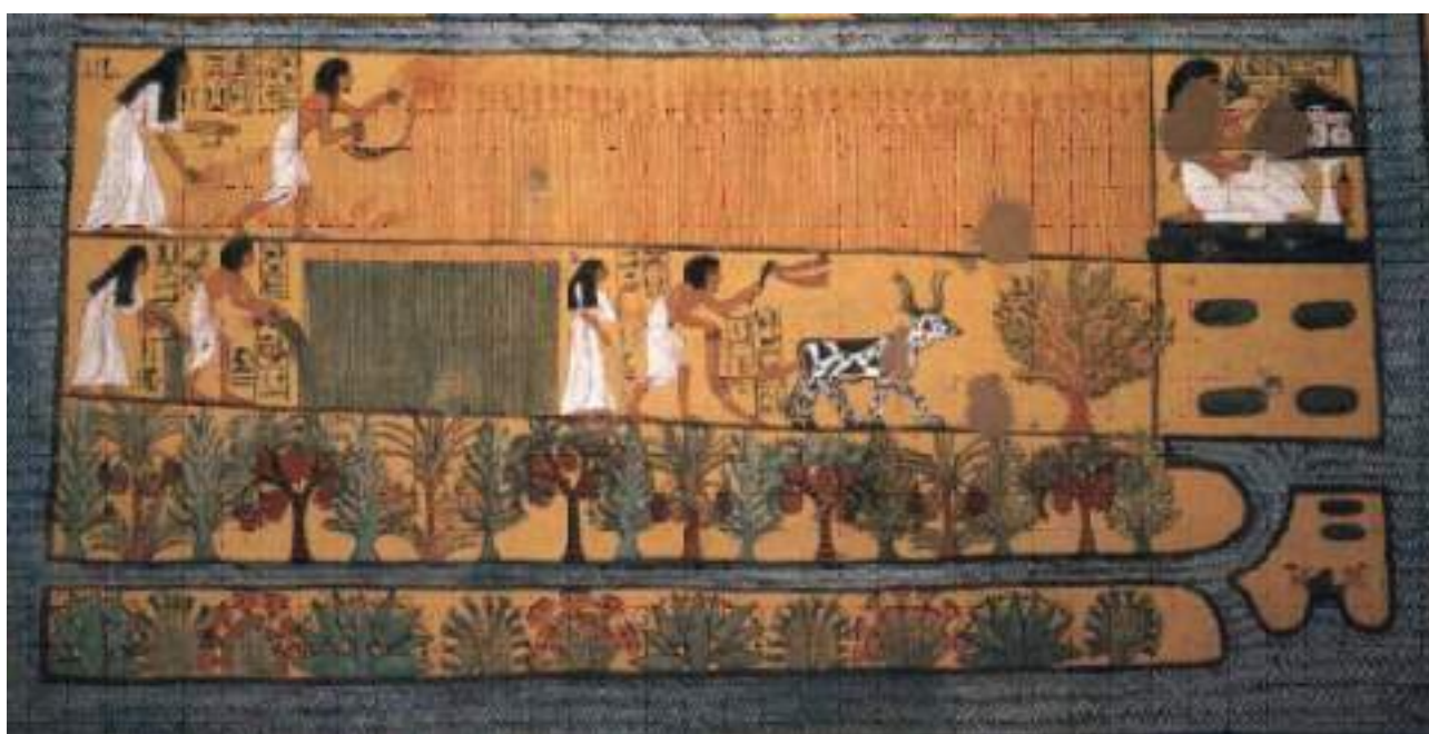
Fig. 1. The Image of a daily life of people.

As can be seen in the following picture, the color of the mummy and Anubis skin, divine beings, are golden,