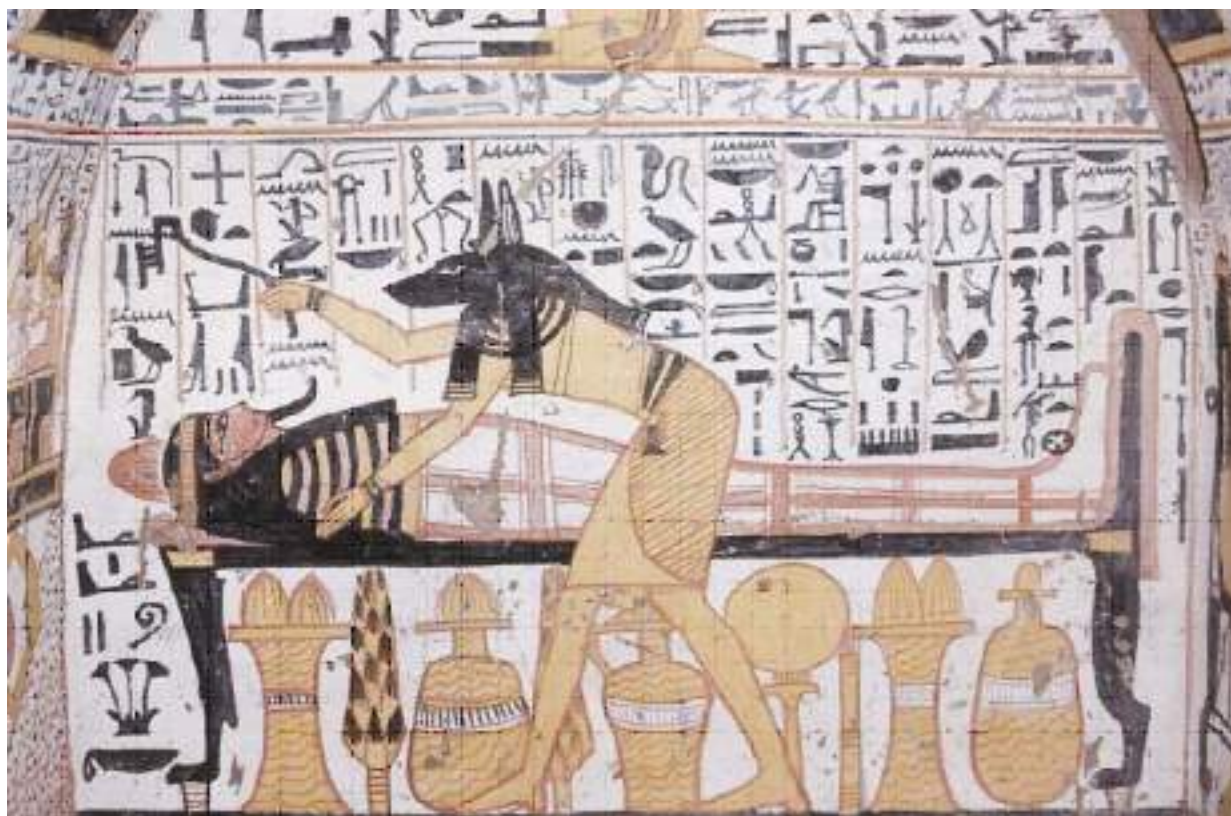
Fig. 5. The mummification ceremony of one of the pharaohs by Anubis.