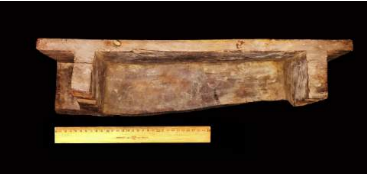
Fig. 3. Side view of the senet gaming table, showing the back panel and perpendicular supports (courtesy of the Rosicrucian Egyptian Museum, San Jose, California, USA).

leaving two empty spaces at either end of the board (fig. 6). Four of the squares are marked with hieroglyphs: nfr , mw , three seated men, and two seated men. These signs are executed in cursive hieroglyphic writing, and they conform to one of several variations on the canonical progression of ‘good, water, three, two’ in squares 26 to 29 of senet boards. The incisions making up the signs are executed in such a way that mimics the writing of signs in ink, which may suggest that the person who carved them copied them from a written prototype. The hieroglyphs are drawn so that they are upright when the board is positioned with them at the top left, with the long vertical panel at the back, indicating