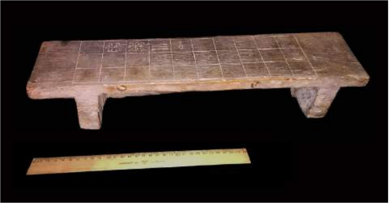
Fig. 2. Senet board, RC 1261, in the Rosicrucian Egyptian Museum.