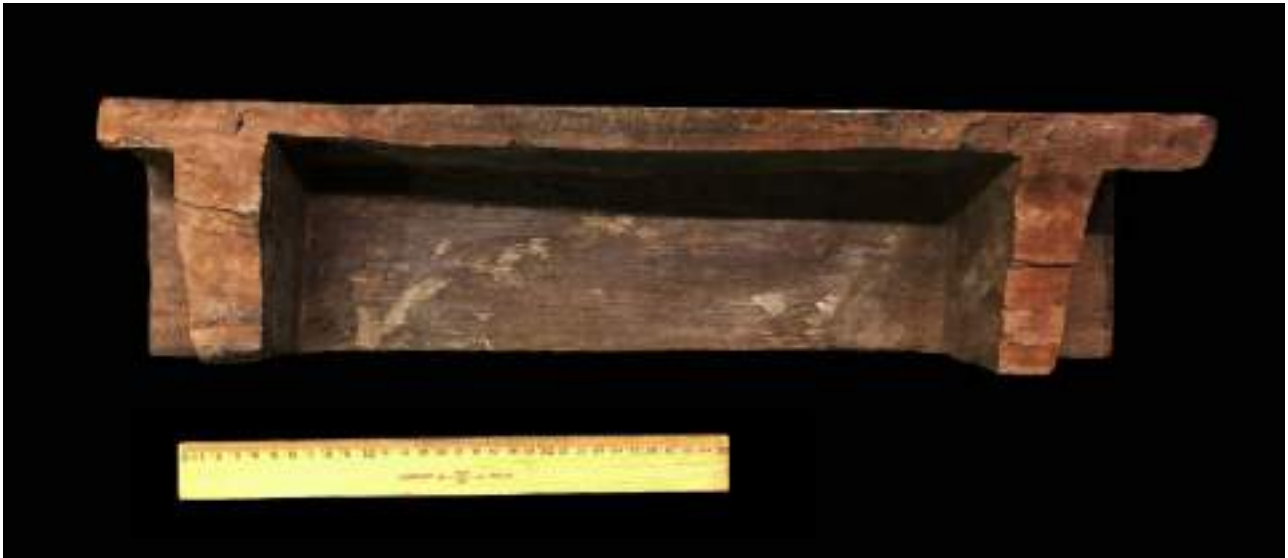
Fig. 4. Bottom view of the senet gaming table, showing the underside of the top panel bearing the senet pattern (courtesy of the Rosicrucian Egyptian Museum, San Jose, California, USA).