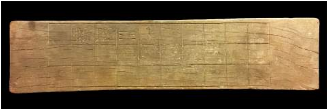
Fig. 6. Top view of the senet gaming table showing the gaming pattern (courtesy of the Rosicrucian Egyptian Museum, San Jose, California, USA).