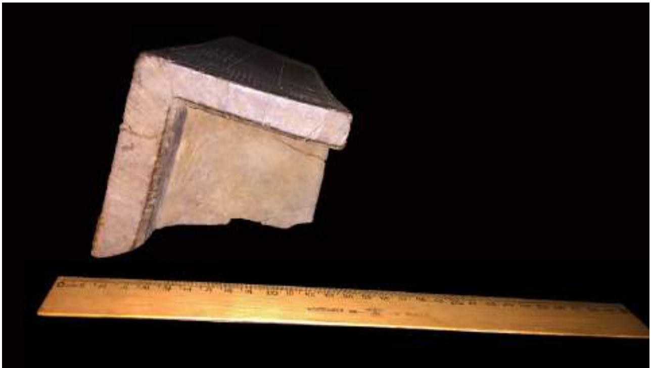
Fig. 5. View of the senet gaming table from the left side, showing that it cannot stand upright in its current condition.

Hatshepsut. 23 It is a wooden board of box type, with ivory inlays dividing the wooden spaces. Squares 26, 28, and 29 are preserved, with the same cursive hieroglyphs incised in those playing spaces as those that appear on the Rosicrucian board: nfr , three seated men, two seated men, respectively. 24 This board contains the game of 20 squares on the opposite side, a common feature of New Kingdom senet boards. 25