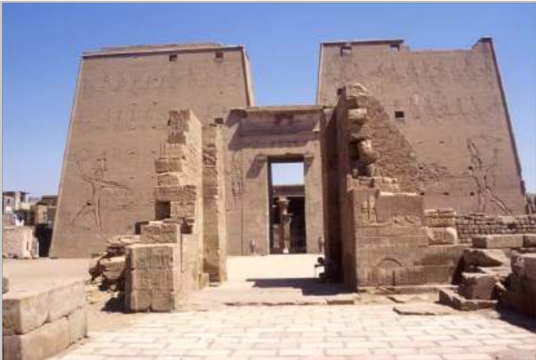
Figure 2 Pylon of the temple of Horus at Edfu, symbolizing the horizon where the statue of the god would appear, like the sun in the horizon.