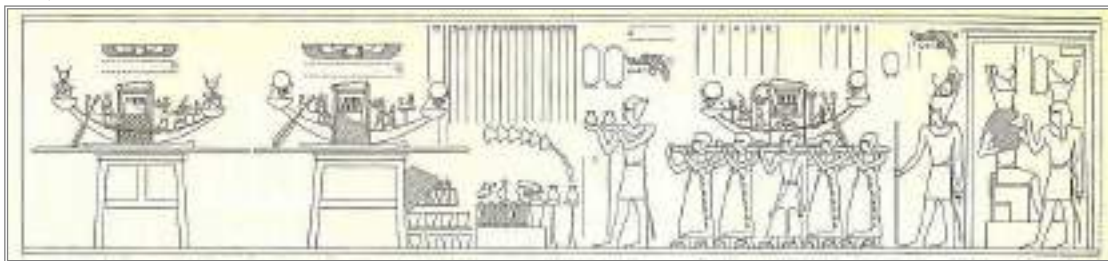
Figure 8 Selection of scenes from the Beautiful Feast of Behdet depicted on the walls of the open court, temple of Edfu.

The temple of Esna provided the setting of a series of local festivals celebrated throughout the year, described in detail on the columns of its pronaos (Sauneron 1962). The most important of these festivals took place on the first day of Phamenoth and was a