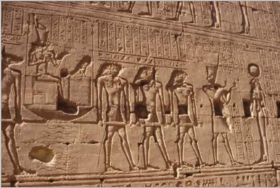
Figure 1 Procession of the statue of Horus on the occasion of the Festival of the Coronation of the Sacred Falcon, temple of Edfu.