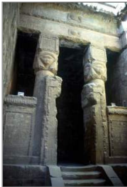
Figure 3 The wabet (part of complex of wabet and court) in the temple of Dendara: an important stage on the processional journey of the statues of the gods on New Year’s Day.

Within the temple precinct, the procession could journey towards the birth temple (“ mammisi ”) or the sacred lake, among other places. For instance, at the temple of Dendara, a large number of deity-statues often traveled to the bark station and the sacred lake in the month of Tybi (fig. 5; Cauville 1993; 2002: 28 - 29; Preys 2002: 563 - 565), while the goddess Hathor journeyed in procession to the mammisi on no less than six occasions throughout the year (fig. 6; Cauville 2002: 26 - 28).