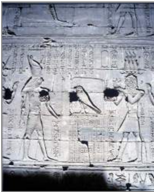
Figure 10 The sacred falcon during the Festival of the Coronation of the Sacred Falcon, temple of Edfu.

combination of the local festival of the “Installation of the Potter’s Wheel,” a feast of local deity Khnum, and the Memphite festival of “Lifting up the Sky,” in honor of the god Ptah. Other important feasts that took place in and around the temple of Esna were the celebrations surrounding the “Arrival of Neith