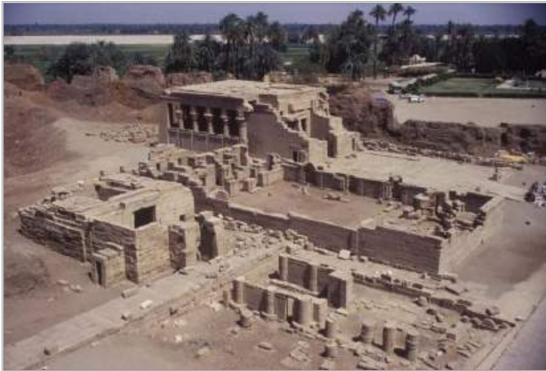
Figure 6 The two birth houses (“mammisi”) within the temple precinct of Dendara.