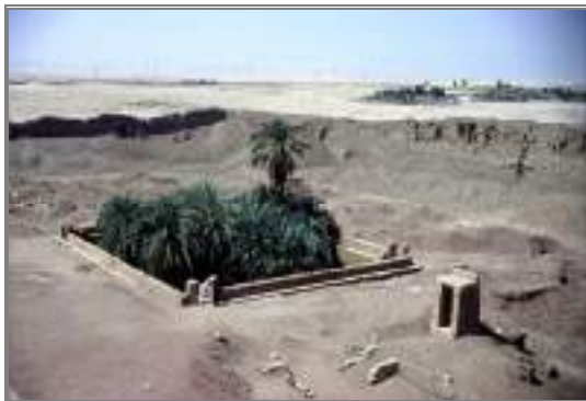
Figure 5 Bark station and sacred lake in the temple precinct of Dendara.

was in essence a popular festival and involved the public more than most other festivals, since it took place largely outside the temple precinct. The festival is described in great detail and depicted on the walls of the open court in the temple of Edfu (figs. 7, 8; Chassinat: Edfou V: 28 - 35, 124 - 136; Edfou X, pls. cxxi-cxxii, cxxvi-cxxvii). It consisted of a 180-kilometer journey that the statue of the goddess Hathor undertook by boat from Dendara to Edfu. On the way to Edfu the procession would halt at several towns, including Thebes and Hierakonpolis, to pay a visit to the deities in the local temples. From Hierakonpolis onwards, the local form of the god Horus would accompany Hathor on her journey to Edfu in his own boat. Numerous pilgrims would gather at these towns to witness the procession of the goddess; other Egyptians would observe the boat of the