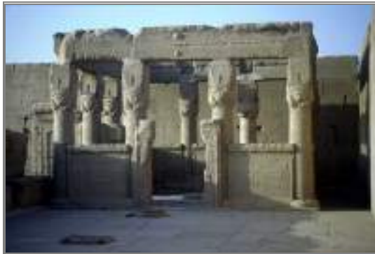
Figure 4 Kiosk on the roof of the temple of Dendara: the final stage of the processional journey of the statues of the gods on New Year's Day.