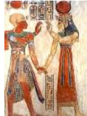
Fig.24 Ramses III with Deity Isis [36].