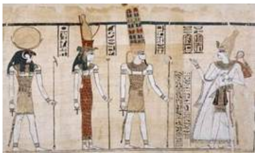
Fig.18 Ramses III in the Great Harris Papyrus [31].