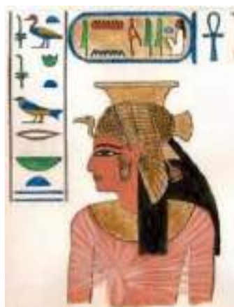
Fig.4 Queen Meritapun in her Tomb [15].