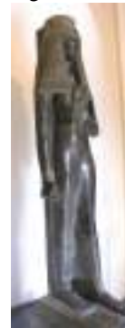
Fig.6 Statue of Tuya mother of Ramses II [17].