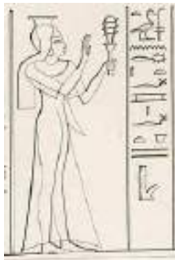
Fig.8 Princess Henuttawy in Abu Simbel [20].