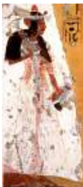
Fig.17 Girl from the Tomb of Ipy [29].