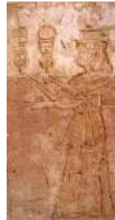
Fig.9 Pharaoh Tawosret wife of Seti II [21].