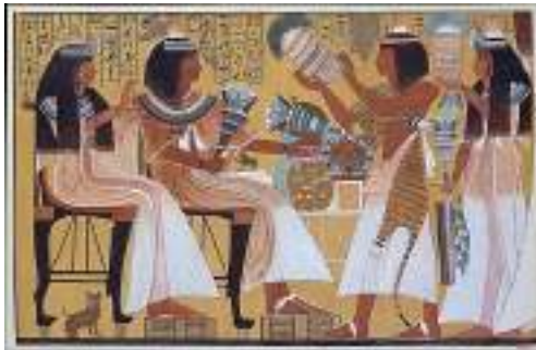
Fig.12 Sculptor Ipuy and his wife [24].