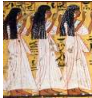
Fig.10 Colored scene from Pashedu Tomb [22].