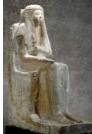
Fig.14 Priestess Enehy statue [26].