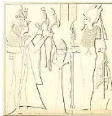
Fig.19 Queen Tiye wife of Ramses III [32].