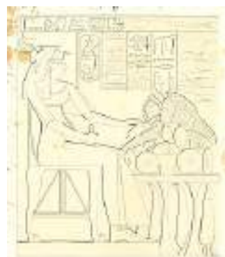
Fig.21 Queen Duatentopet wife of Ramses IV [34].