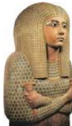
Fig.5 Coffin of Queen Meritapun [16].