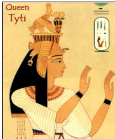
Fig.22 Queen Tyti wife of Ramses X [4].

worshiping position and wearing a half_sleeved white Tunic with brown lines decorating it.