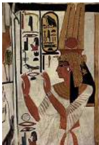
Fig.2 Scene of Queen Nefertari [5].