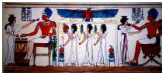
Fig.20 Wives of Ramses III [33].