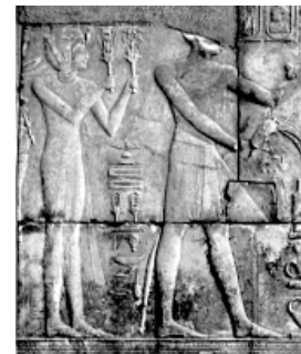
Fig.1 Queen Sitre [13].