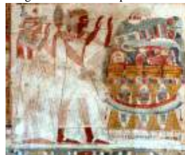
Fig.11 Colored scene from Neferrenpet Tomb [23].