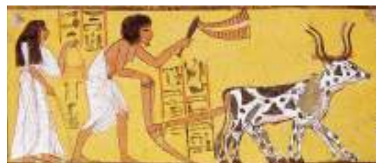
Fig.16 Plowing and sowing scene [28].