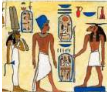
Fig.7 Queen Isetnofret before Khnum [19].