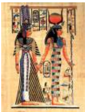
Fig.3 Queen Nefertari with Isis [14].