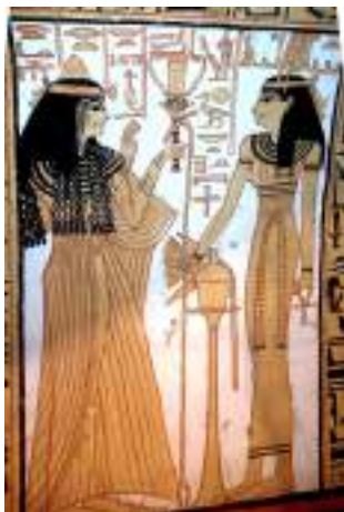
Fig.13 Nakhtamun mother with Maat [25].