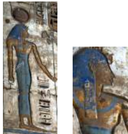
Fig.25 Deity from the Temple of Ramses III [37].