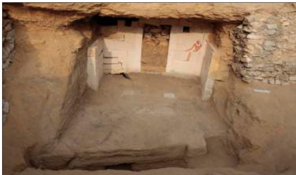
Fig. 2. West facade of the Dry Moat: Old Kingdom structures discovered in 2012, the floor of the chapel of Ikhy/Mery constituting the ceiling of the lower structure

[...] ḥtmtj ntr mtj n ʿpr jm3ḥw ḥr Pth Mrjj [...] god's sealer, controller of the crew, honoured one by Ptah, Mery.