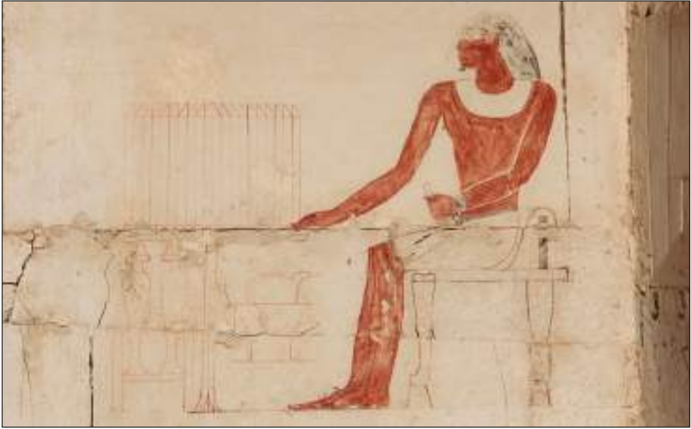
Fig. 3. Offering table scene on the west wall of the facade of the chapel of Ikhi/Mery