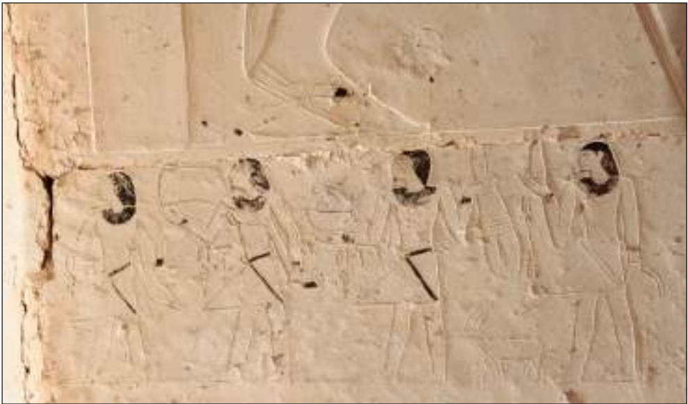
Fig. 4. North wall of the chapel facade: lower part of the unfinished decoration