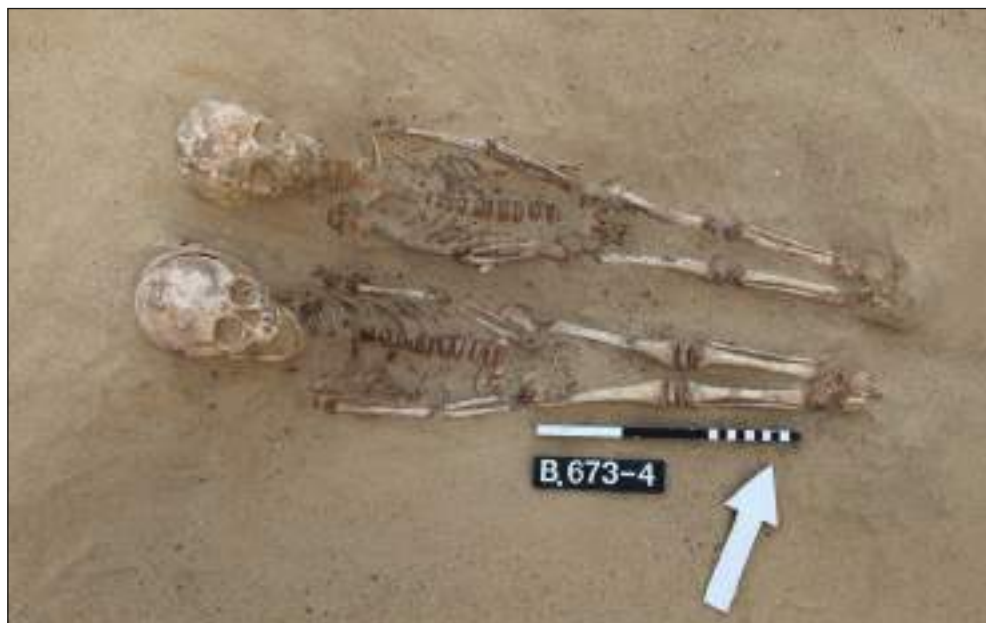
Fig. 7. Double burial of children (Nos 673–674) in square 1814

Below the Upper Necropolis, there was a layer 2.50 m thick of pure aeolian sand overlying a layer of compact dakka at a depth of approximately 6.00 m below the present surface. The excavation stopped on the surface of the dakka , and the area was secured with sequences of stone walls