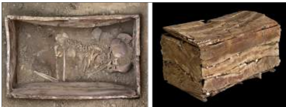
Fig. 9. Old Kingdom child burial (No. 652) in a wooden coffin in a burial shaft; right, the coffin after restoration