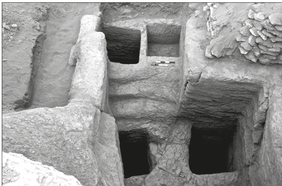
Fig. 8. East part of the Dry Moat: Old Kingdom funerary shafts explored in 2014, in front of Corridor 2

and prevent its disintegration. Once the wooden elements were suitably documented (photographs, drawings, description), they were dismantled and conserved. The coffin was reinforced