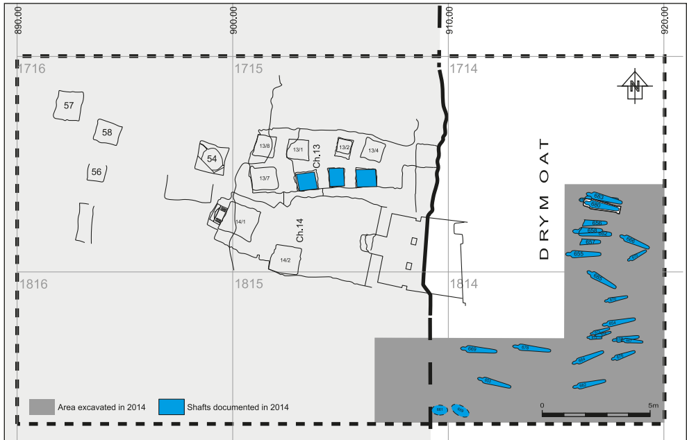
Fig. 5. West side of the Dry Moat: area explored in 2014 (Drawing K.O. Kuraszkiwicz)

The lower structure could not be excavated without the enlargement of the excavation field in front of it and the securing of access to the entrance of the tomb from the west via a system of protective terraces. This was accomplished in the delayed 2013 season (which eventually took place in early 2014), digging a 10 m long (N–S) and 13 m wide (E–W) zone in squares 1714, 1814 and 1815, i.e., in front of the rock-hewn tomb of Ikhi/Mery. The exploration removed a stratum of mostly aeolian sand 6.20 m deep