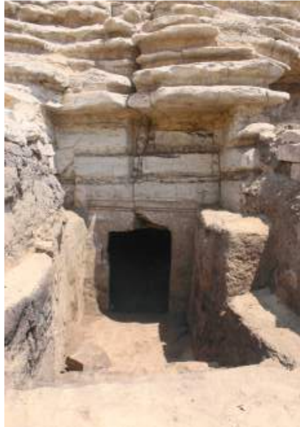
Fig. 7 Entrance of New Kingdom tomb no. 1

This tomb dates to the New Kingdom (Eighteenth Dynasty), based on the architectural elements. It is carved into the rock in the east end of the explored area, between tomb no. 5 to the west and the tomb of Raia to the east. Although it is unfinished, its opening features a limestone gate which represents its façade. This gate was found cracked and required restoration, and it is