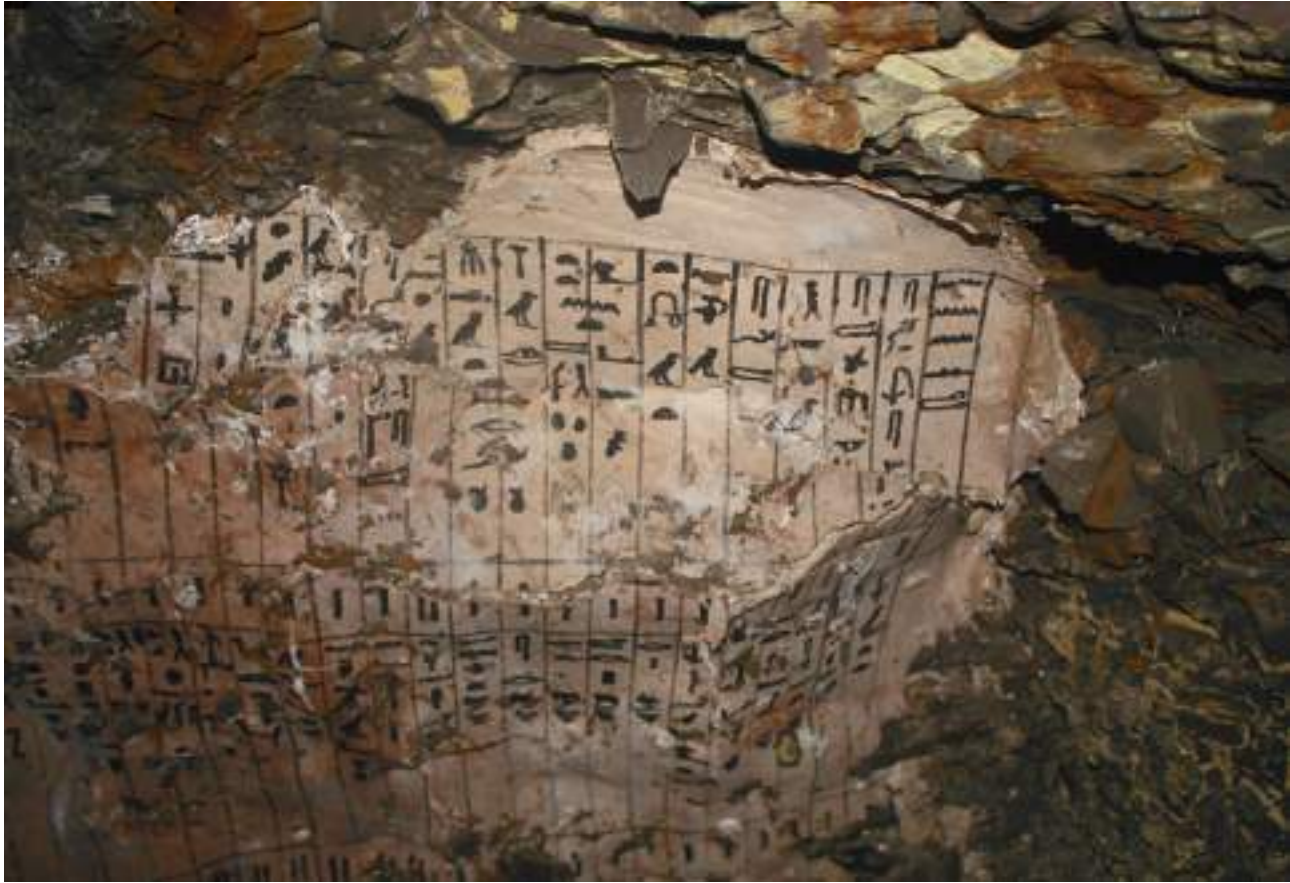
Fig. 6 A part of the offering list in the burial chamber of Old Kingdom tomb no. 5

which is probably an instrument for the Opening of the Mouth ritual.