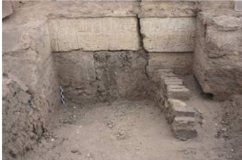
Fig. 3 Detail of the façade of the tomb of Wahty (tomb no. 7) with its closed entrance

to a depth of 0.50 m and then becomes only 1.00 × 1.05 m large, with a final depth of 5.00 m. The shaft was filled with debris of tafla mixed with sherds of Old Kingdom pottery. A small burial chamber to the west of the shaft measures 2.00 m in a north-south direction, 0.82 m in an east-west direction and 0.70 m in height. The debris contained a wooden coffin in a poor state of preservation (1.60 m in length, 0.60 m in width and 0.36 m in height) with its cover moved. The coffin still held a skeleton of a person who may have been Wahty himself. No objects were discovered inside except the remains of Old Kingdom ceramic jars.