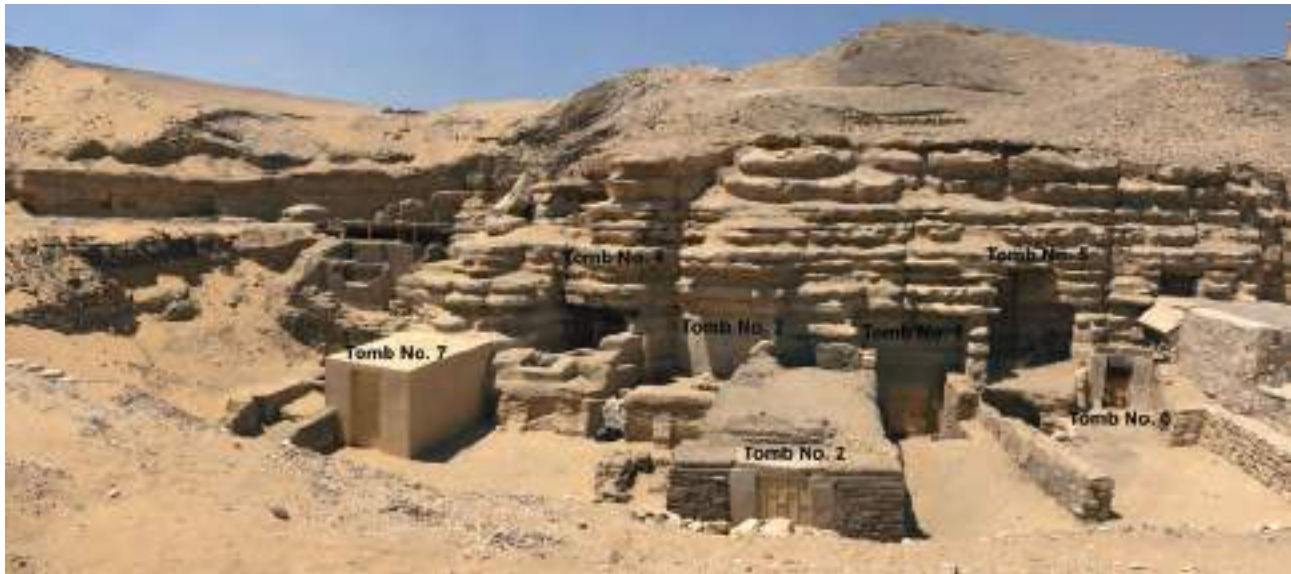
Fig. 1 General view of the site in July 2019