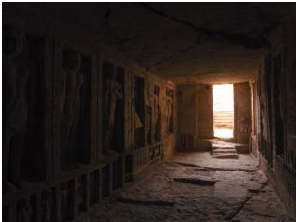
Fig. 4 The rock-cut tomb of Wahty from the north

The tomb of Khufuemhat is situated slightly to the east of that of Wahty, and it can be dated to the late Old Kingdom, probably the Sixth Dynasty, based on the finds in the debris. The northern façade is about 3.3 m in width in an east-west direction. It contains reliefs in very bad condition and scenes of daily life, mostly destroyed, which are very difficult to trace. We can recognize a part of the tomb owner sitting in front of an offering table. To his left, the western wall starts, on which we can see the false door of Khufuemhat ( Hwfw-m-h3t ) (fig. 5). It is 1.0 m wide, 1.3 m high and some of its features are today lost. The name of the deceased,