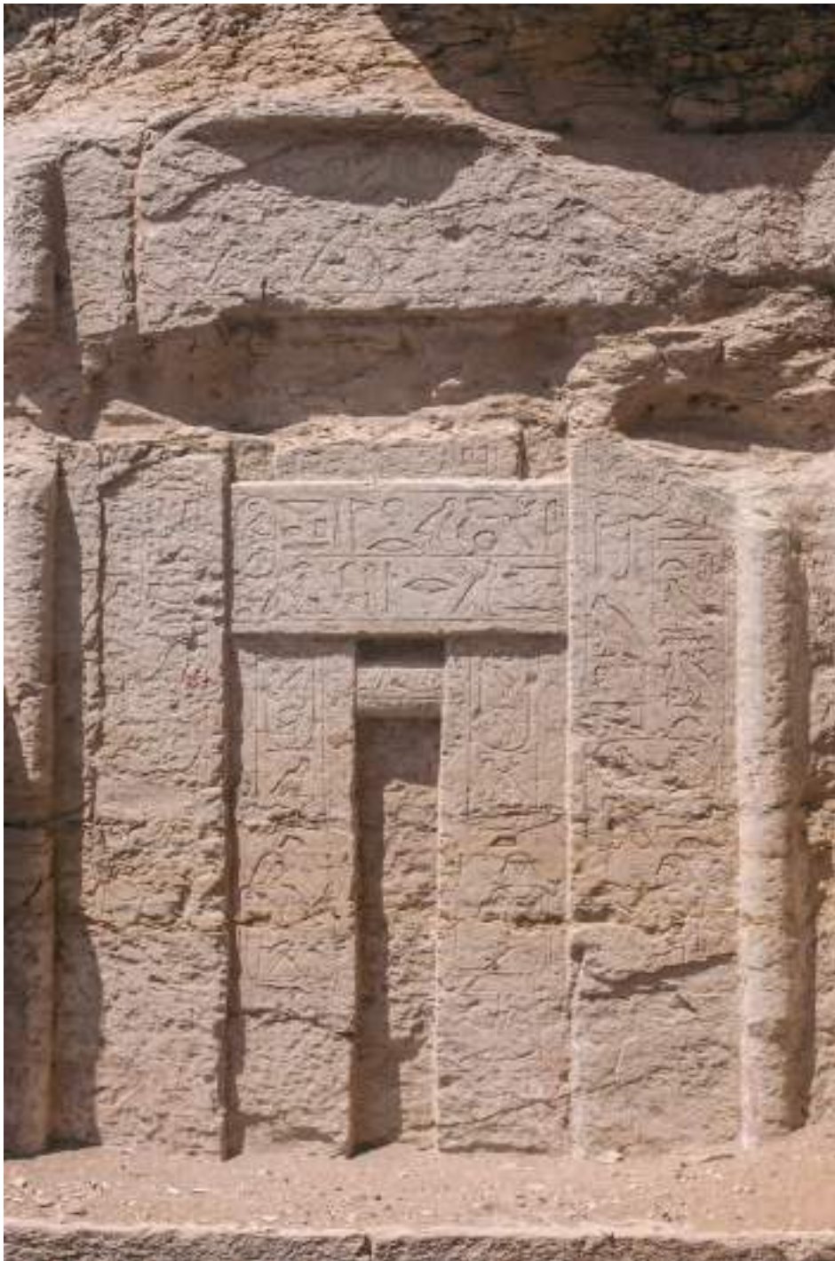
Fig. 5 The false door of Khufuemhat on the façade of tomb no. 3

Khufuemhat, and his titles are preserved, carved in sunken relief, and has not been attested before (see Ranke 1935: 268, nos. 5–10; Scheele-Schweitzer 2014). The three titles shown on the false door include the following: